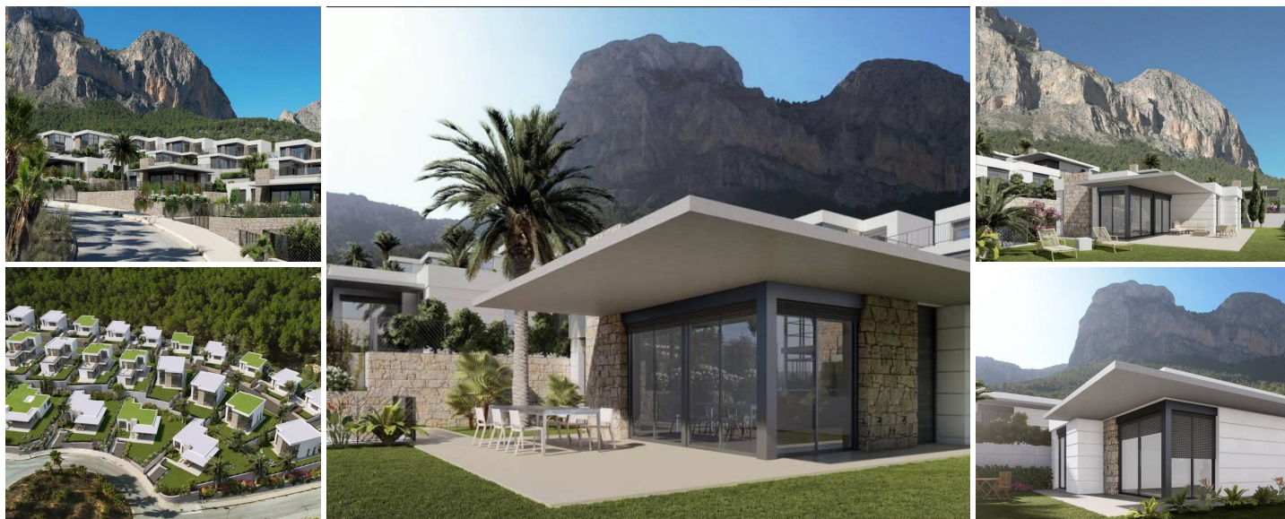
New Construction Villas in Polop, Alicante