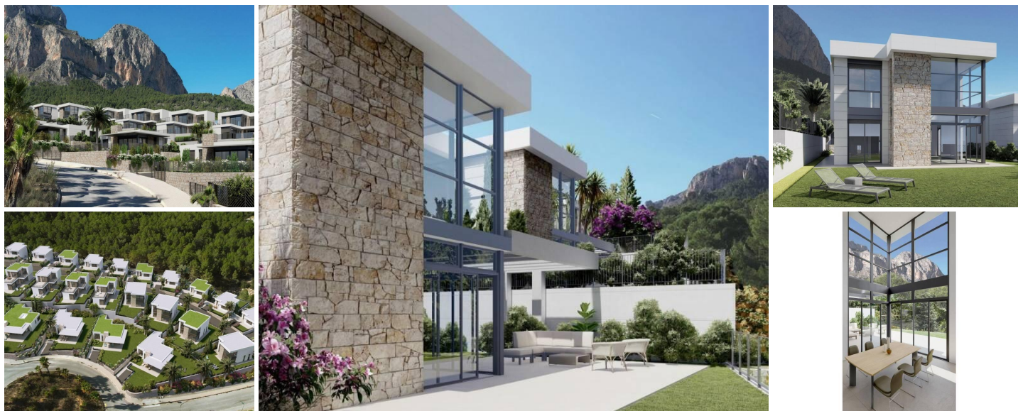
New Construction Villas in Polop, Alicante