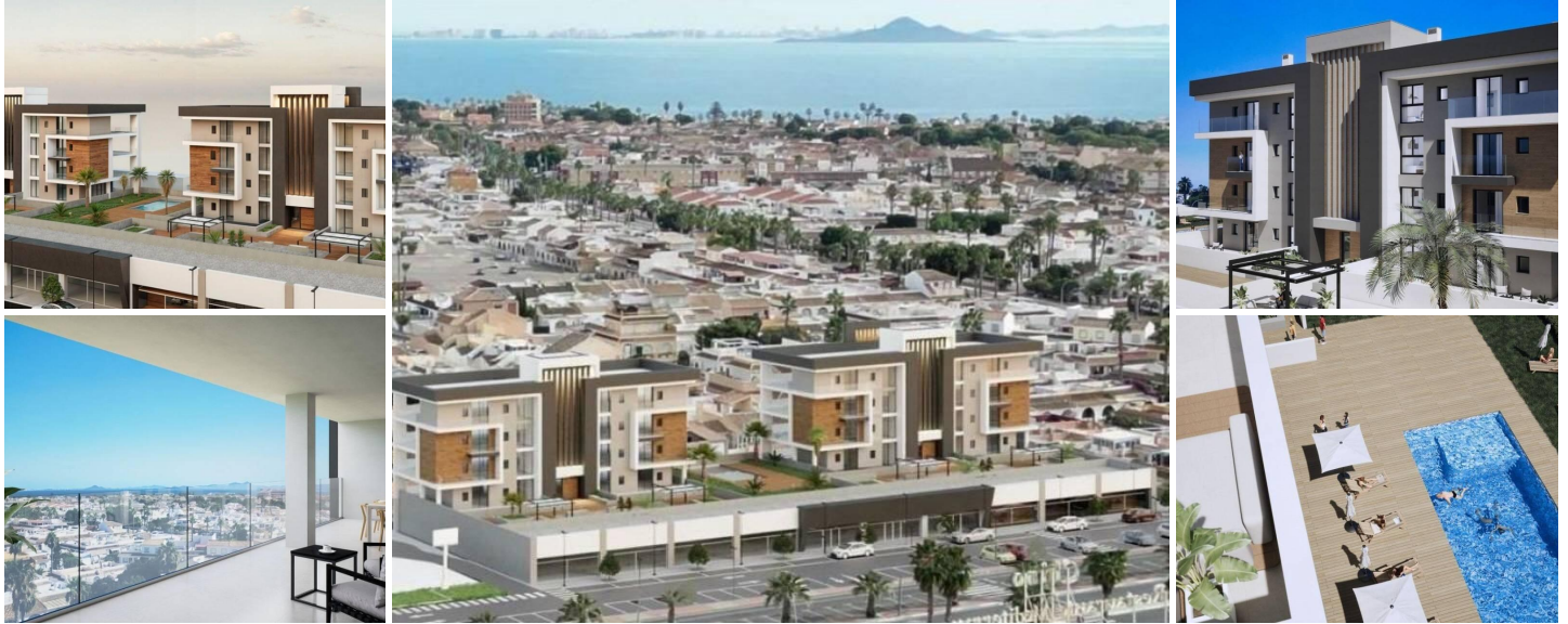
Tourist Apartments with Rental License in Los Narejos, Los Alcázares