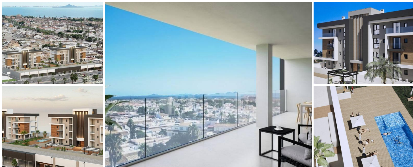
Tourist Apartments with Rental License in Los Narejos, Los Alcázares