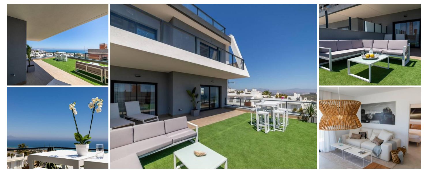
NEW APARTMENTS FOR SALE IN GRAN ALACANT, AT 20 MINUTES FROM ALICANTE and ELCHE, COSTA BLANCA

New development with 170 apartments in Gran Alacant, with views of the Mediterranean Sea and direct access to the blue flag beach of El Carabassi.