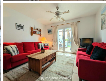
Las Palmeras Suzy

Nice townhouse located in Mojacar Playa in the quiet residential area known as El Palmeral, a very short walk ( 30 metres) to beach and amenities. The nearest beach is Playa del Descargador. Also, a short walk to the commercial center.