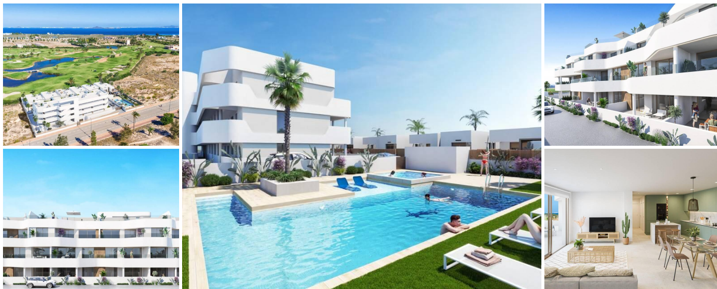
New Build Residential complex in Los Alcazares

Los Alcázares is an idyllic location for those looking to invest in a new residential property on the Costa Cálida. Just 25 minutes from Murcia Airport and approximately 55 minutes from Alicante Airport, this area is conveniently connected by highway to major cities like Cartagena, Murcia, and Alicante, as well as to other beautiful beaches along the Costa Cálida and Costa Blanca.