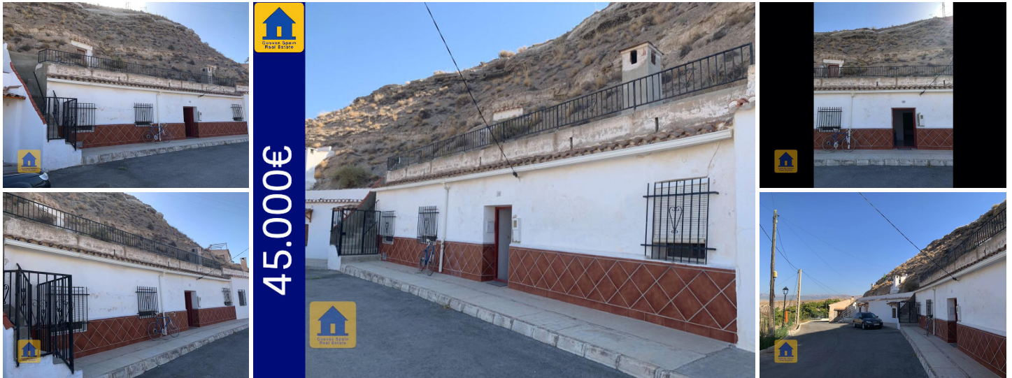
Cueva Mercedes in Galera ref: cs2182

This is a charming cave house in a great location on the quiet outskirts of the beautiful village of Galera, just 10 min walk to amenities. The cave has a roof balcony with stunning views to the west. There is an entrance hall, living room, kitchen, 2-3 bedrooms, bathroom and storage spaces. In front of the property is a sidewalk with parking space for two cars.