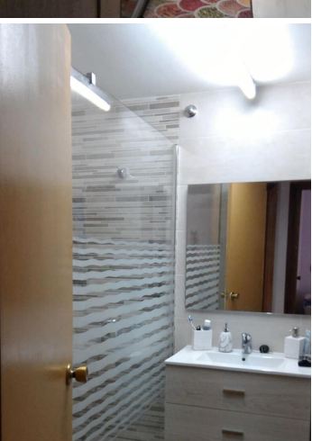
Top Floor Apartment, Fuengirola, Costa del Sol. 3 Bedrooms, 1 Bathroom, Built 110 m².

Condition: Excellent, Recently Renovated.