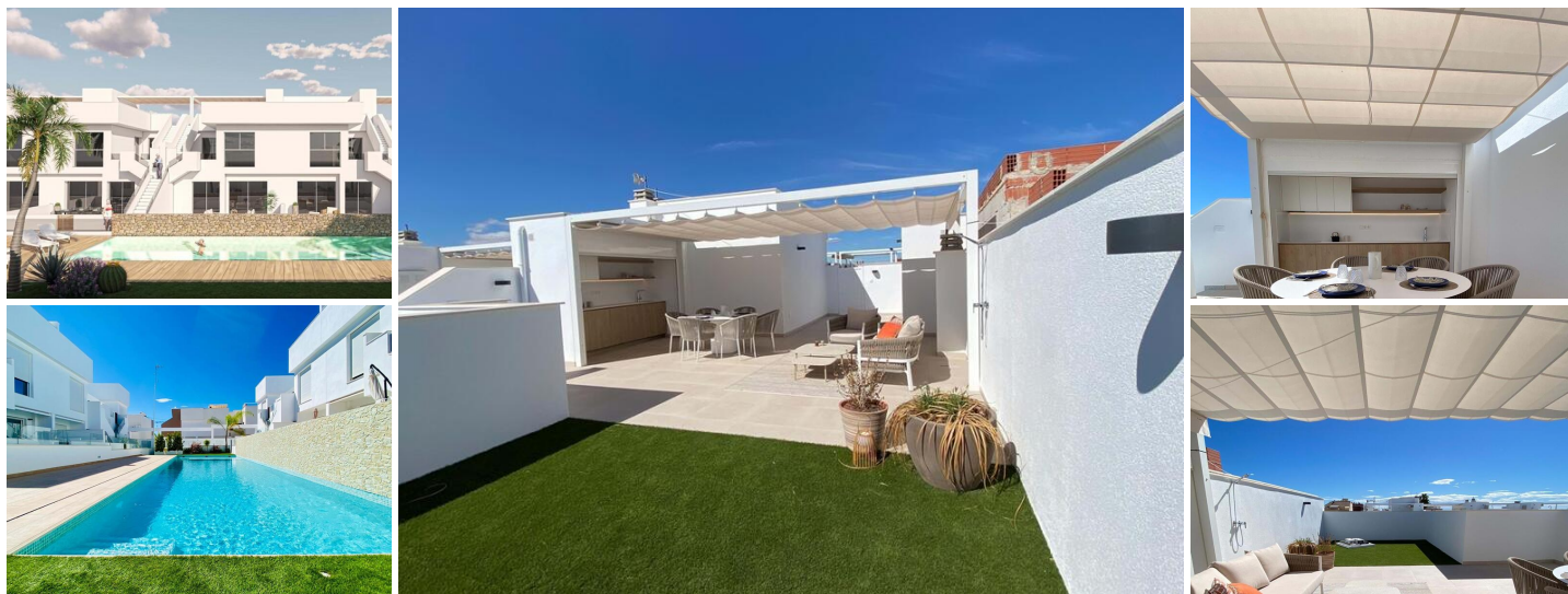
New Build Bungalow Residential Complex in Pilar de la Horadada