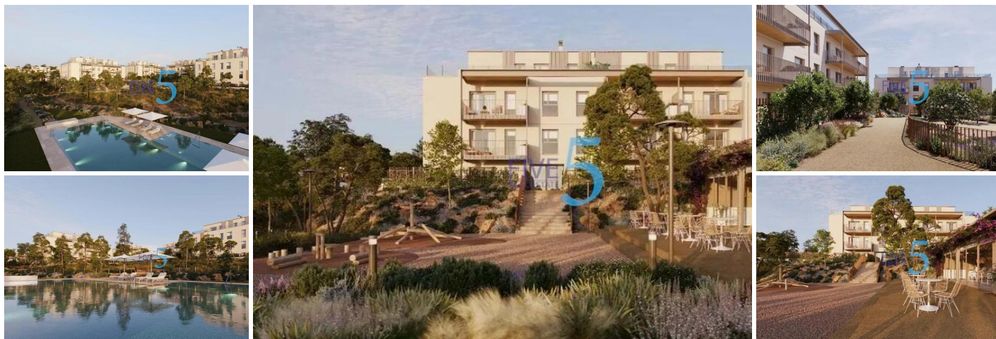
NEW BUILD RESIDENTIAL COMPLEX IN GODELLA, VALENCIA

New Build development with high quality is a constant and an ever-present objective, which is why we have thought of all the details of your new home.