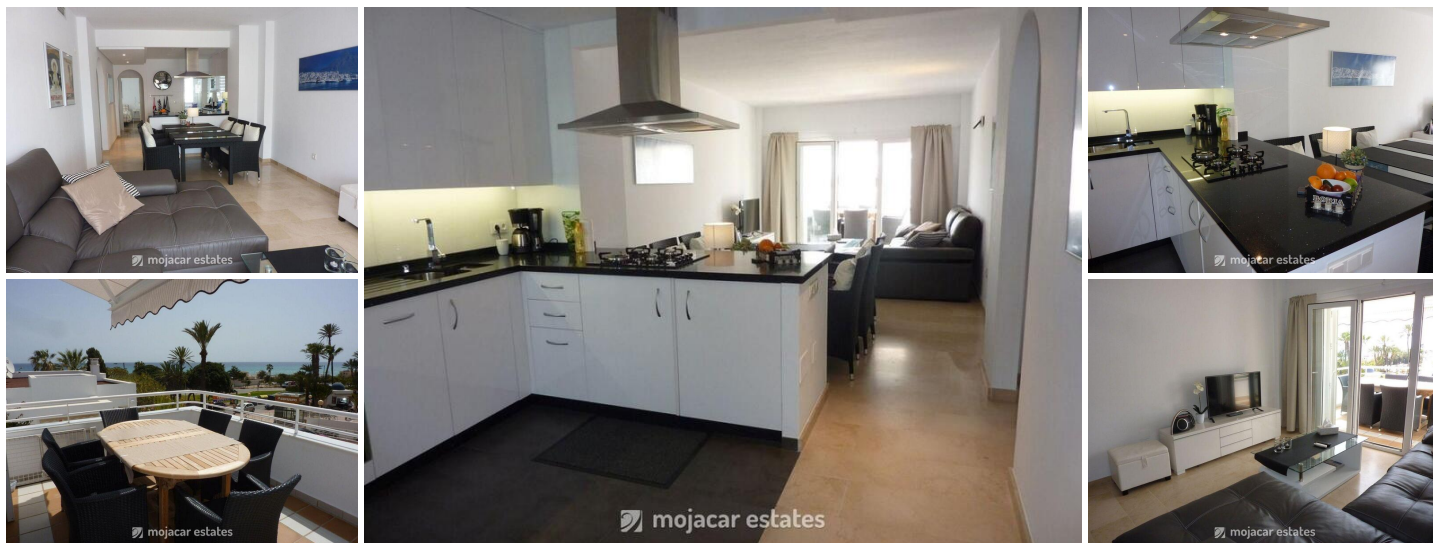
Parque Residencial Best

Fantastic top floor apartment for 6 people in residential complex in sea frontline position with superb terrace overlooking the sea and located next to Commercial Centre in Mojácar Playa, very central location with all shops and amenities within easy walking distance.