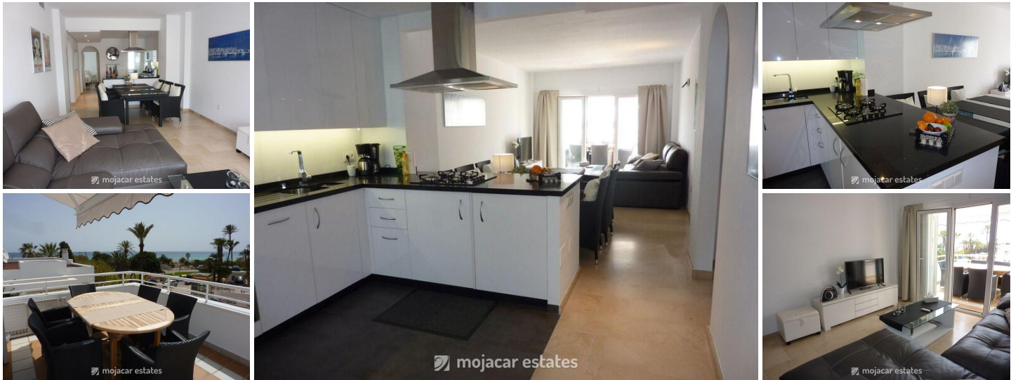
Parque Residencial Best

Fantastic top floor apartment for 6 people in residential complex in sea frontline position with superb terrace overlooking the sea and located next to Commercial Centre in Mojácar Playa, very central location with all shops and amenities within easy walking distance.