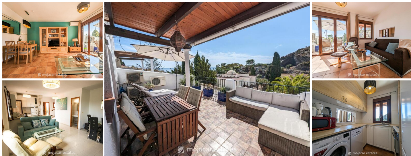
Balcones del mar Juli

Welcome to your perfect vacation destination in the sunny south end of Mojácar! This newly renovated holiday home promises an unforgettable experience for up to four guests. With two levels of modern living space, a communal pool, and sea views, it's the perfect escape for families or couples seeking relaxation and tranquility.