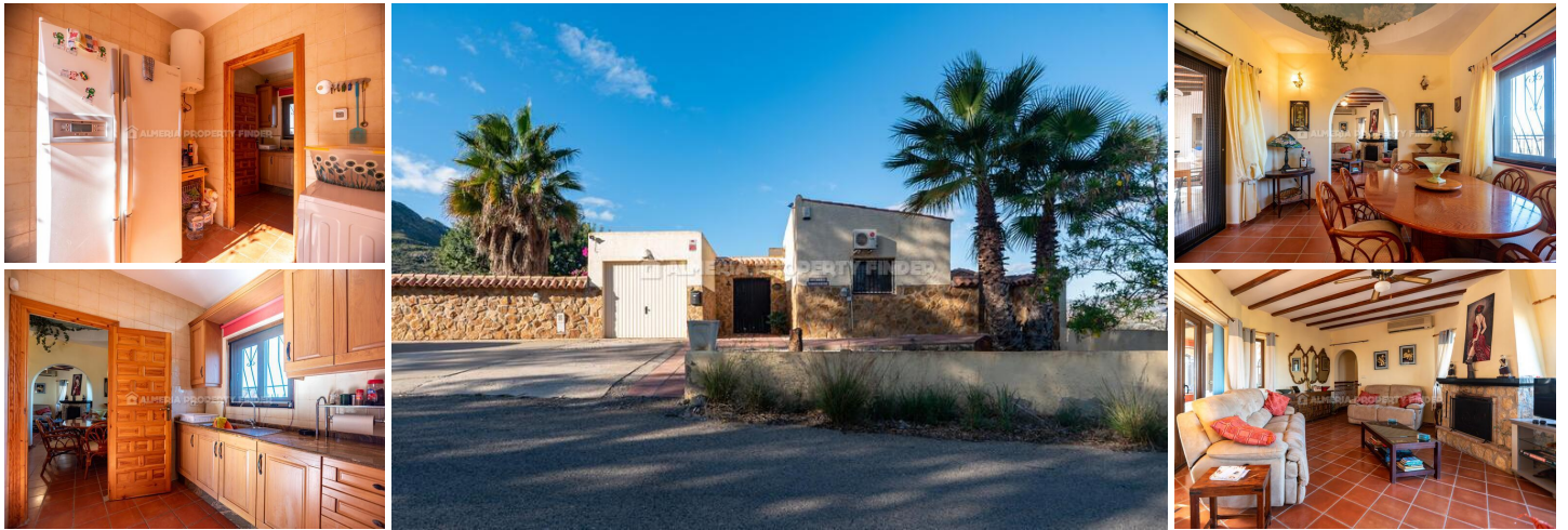
Country House Detra - A country house in the Mojácar area. (Resale)

Cortijo Algorrobo: We are delighted to market this picturesque traditional cortijo constructed over one level with lots of original features. The flat plot is entirely walled or fenced and from the garden you can appreciate some super views. Within the grounds there is a private kidney shaped swimming pool, a covered BBQ area, seating areas and an independent garage.