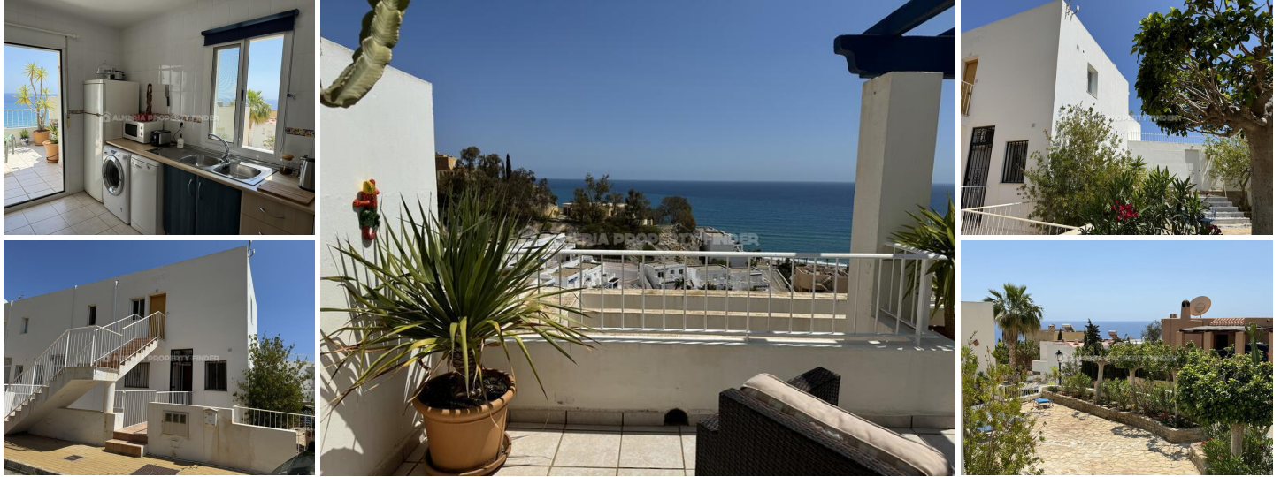
Apartment Kaitlin - An apartment in the Mojacar Playa area. (Resale)

Mojacar Bella: Stunning & superbly presented penthouse apartment with a super huge terrace of 43m2 with breathtaking beach and sea views. This east facing penthouse showcases perfectly the Mojacar sunrise and it has a good contemporary feel with stylish decoration throughout. It is light, bright & airy with a sea view from every room except the bathroom! It comprises living room with patio doors to the terrace, air conditioning, a good size kitchen with doors to the terrace and size window, master bedroom with built in wardrobes, air conditioning and doors to the terrace, second double bedroom with built in wardrobes and air conditioning, full size bathroom with walk in shower and a double sink. Mojacar Bella has a recently refurbished communal swimming pool and well tended gardens. The community fees are just 49€ per month.