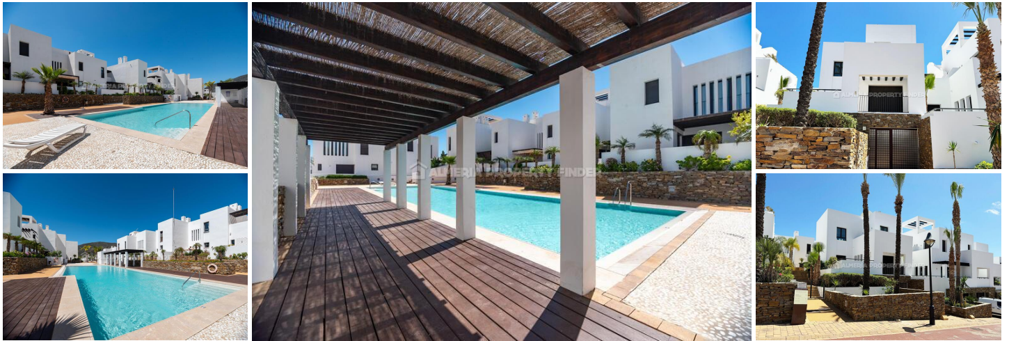
Town House Taylor - A town house in the Mojácar Playa area. (Resale)

Playa Macenas: Appealing and very spacious townhouse situated in the inspirational Playa Macenas and within a well kept urbanization with crystal clear communal pool. The resort offers 24-hour security making it a very safe and secure option for families. Macenas is home to some of the nicest beaches on the coastline and there are lots of restaurants within a 3-mile radius, including the newly opened one on site.