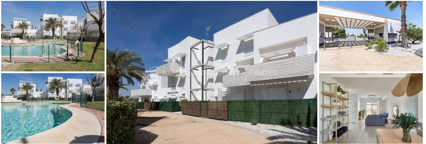
Puerta de Oriente BL2-PB2 - An apartment in the Vera Playa area. (Newly Built)

Groundfloor apartment with 3 bedrooms, 2 bathrooms, 111m 2 build and 97 m 2 outside space.