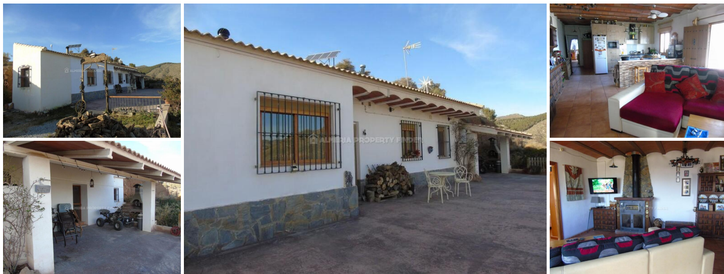
Cortijo Cuernos - A country house in the Purchena area. (Resale)

A quirky detached fully renovated 4 bedroom, 2 bathroom traditional country property. The property has a build of 178m 2 set in an excellent location with stunning views. The typically Spanish village of Lucar is just a few minutes drive away and offers all amenities including a wide variety of shops, bakery, tapas bars, cafes, restaurants, 24 hour medical centre and pharmacy, and a weekly markets. There is also a Municipal swimming pool, primary school.