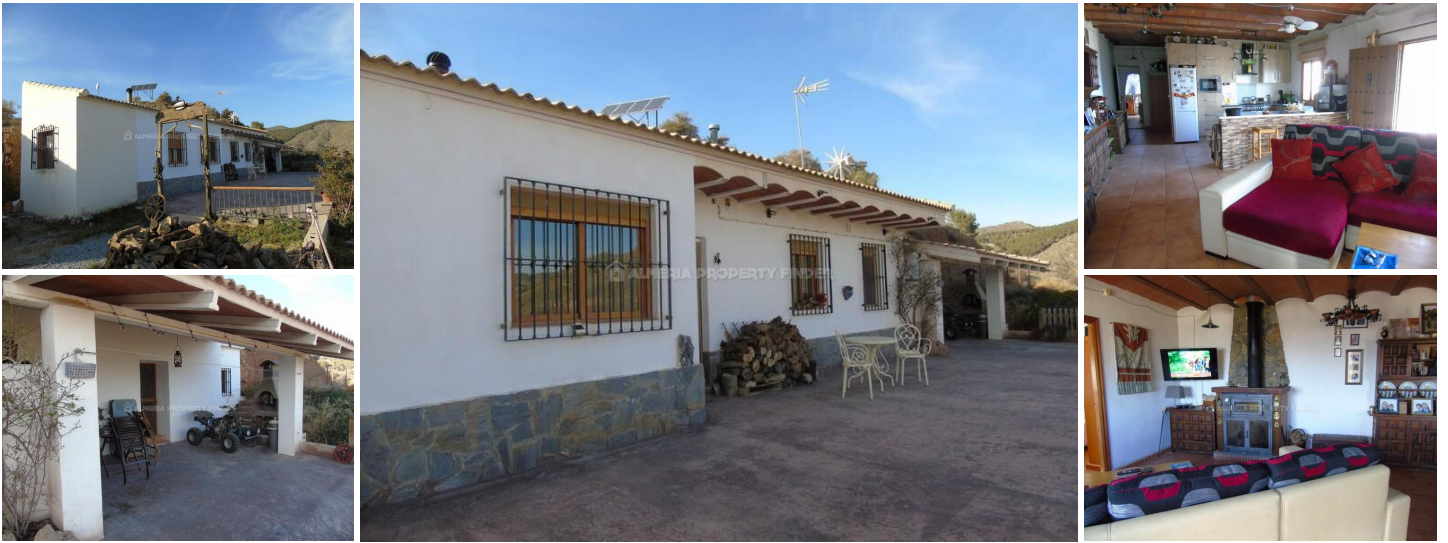
Cortijo Cuernos - A country house in the Purchena area. (Resale)

A quirky detached fully renovated 4 bedroom, 2 bathroom traditional country property. The property has a build of 178m 2 set in an excellent location with stunning views. The typically Spanish village of Lucar is just a few minutes drive away and offers all amenities including a wide variety of shops, bakery, tapas bars, cafes, restaurants, 24 hour medical centre and pharmacy, and a weekly markets. There is also a Municipal swimming pool, primary school.