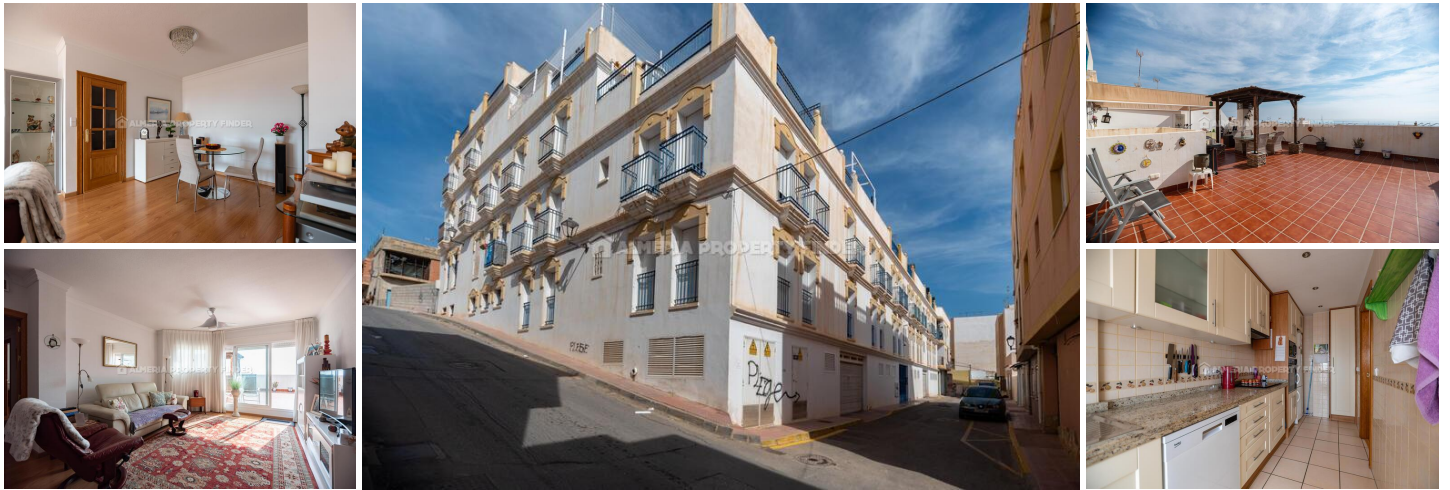
Apartment Min - An apartment in the Garrucha area. (Resale)

A fabulously spacious 215.63m 2 , 3 bedroom, 2 bathroom penthouse apartment with excellent sea views and a huge private terrace of 90m 2 . The apartment is located a few minutes walk to a beach in the Spanish town of Garrucha, famous for its excellent seafood restaurants serving the fresh catch of the day with easy access to a wide range of shops, bars, restaurants, and a lively weekly market and a short stroll from the main high street, the paseo and the port.