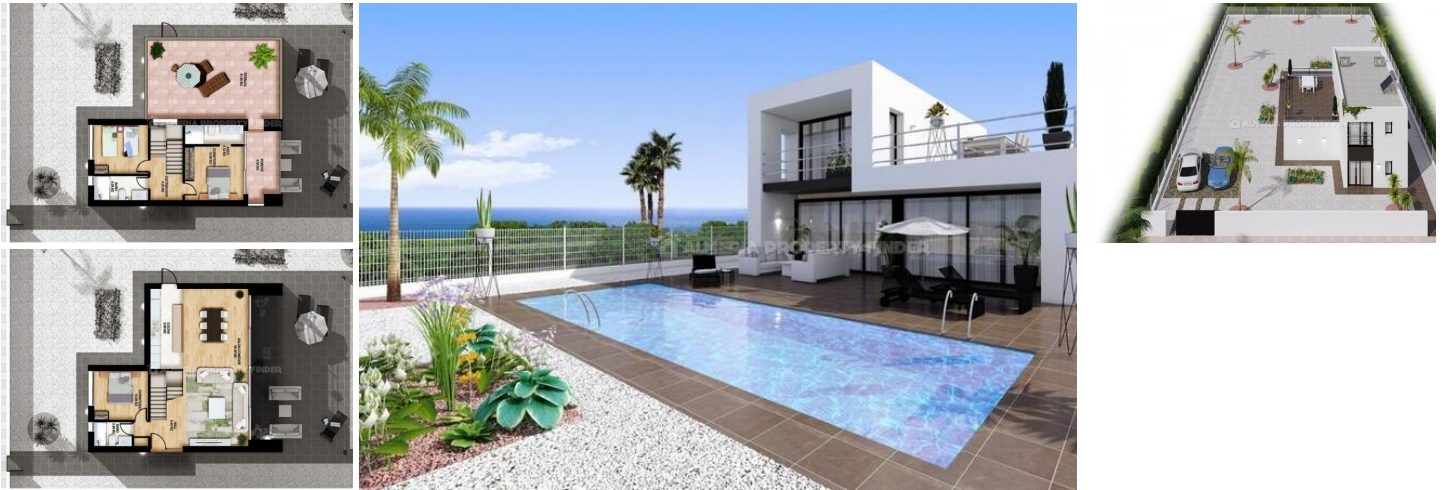
Villa Cabuzana 4 - A villa in the Vera area. (Off Plan)

Fabulous off plan villas in the area of La Cabuzana de Vera.