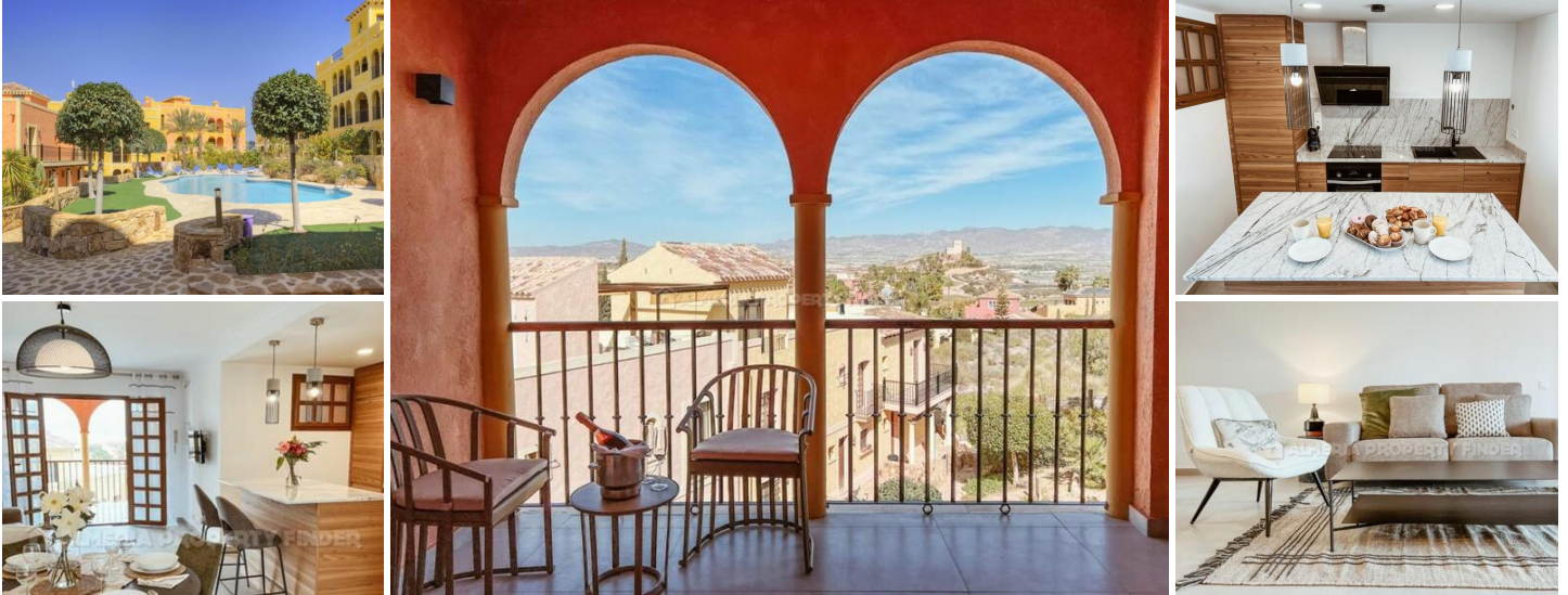
Desert Springs Sierra 147 - An apartment in the Cuevas del Almanzora area. (Newly Built)

Las Sierras III is a private residential development with a selection of NEW two and three-bedroom 'Key-Ready' Apartments set around a private swimming pool, complete with outdoor lounge space, within beautiful landscaped gardens, occupying an envious position on Desert Springs Resort.