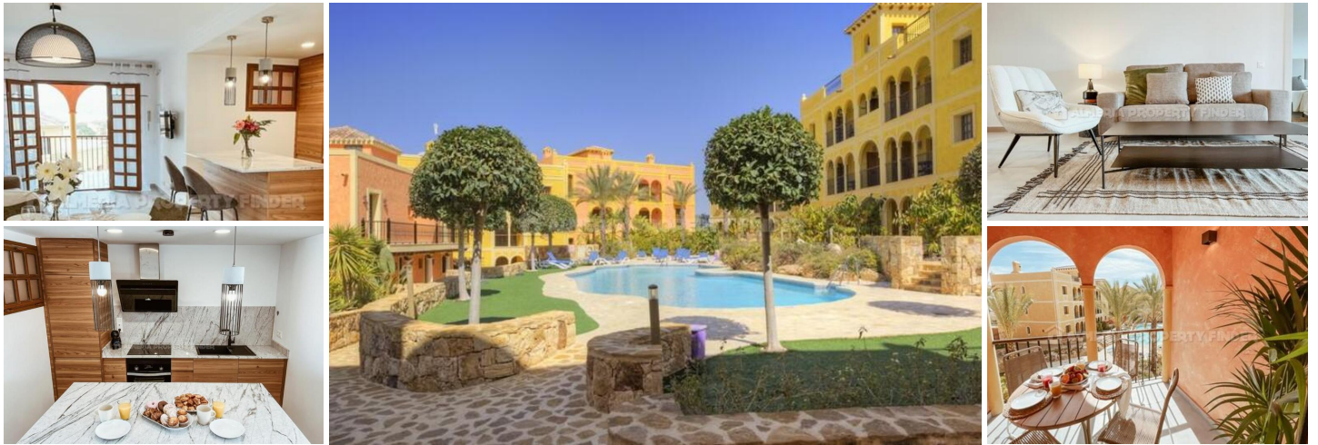
Desert Springs Sierra 253 - An apartment in the Cuevas del Almanzora area. (Newly Built)

Las Sierras III is a private residential development with a selection of NEW two and three-bedroom 'Key-Ready' Apartments set around a private swimming pool, complete with outdoor lounge space, within beautiful landscaped gardens, occupying an envious position on Desert Springs Resort.