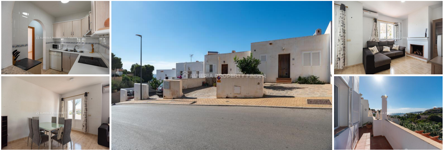
Town House Inez I - A town house in the Mojácar Playa area. (Resale)

Rincon de la Bahia: Super spacious 3 bed, 2 bath townhouse situated very close to the best Mojácar amenities about 350m from the beach front. The property is constructed over two levels with a build size in excess of 90m 2 . The community gardens are well tended and maintained as is the pool with grass surround. At street level the property comprises entrance hallway, original kitchen, living room with chimney & air conditioning and with huge terrace off where you have a lovely sea view and a double bedroom with built in wardrobes. A marble staircase to the lower floor is where you have two double bedrooms both with built in wardrobes and both with access to another super huge terrace. Parking is available in front of the property.