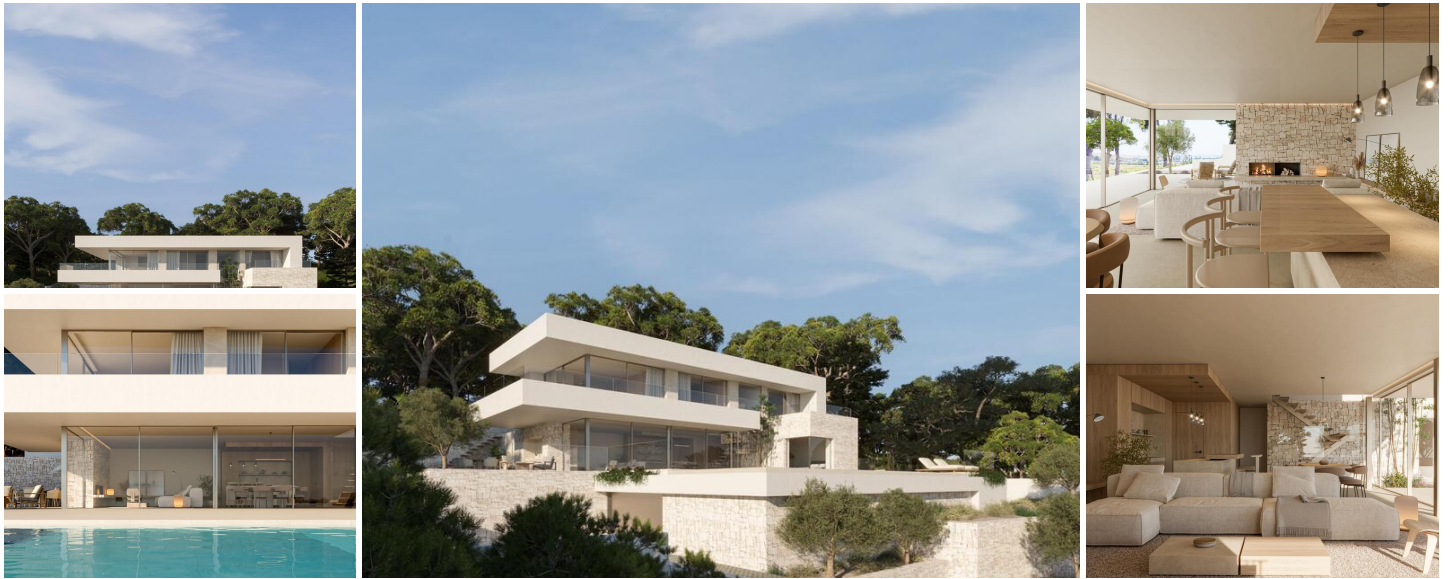
NEW BUILD VILA IN MORAIRA

New Build exceptional villa combining elegance, quality and panoramic sea views in Moraira.