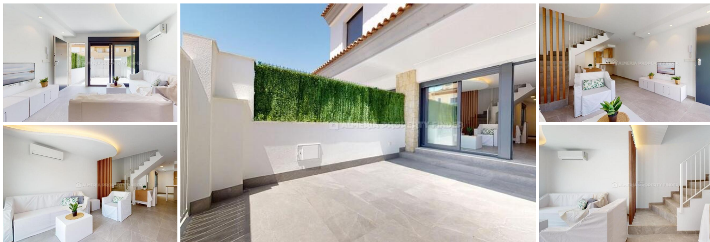
Casa 3 Almirante - A town house in the San Pedro del Pinatar area. (Newly Built)