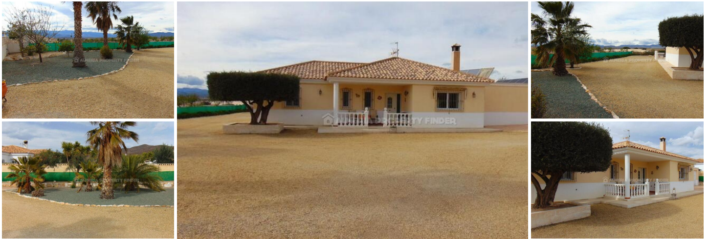
Villa Cantareros - A villa in the Albox area. (Resale)

This furnished 3 bedroom, 2 bathroom villa with a fenced plot of 2.100 m 2 has a private 8x4 swimming pool, garage, large hobby room and badminton court and is situated in Aljambra, Albox. The popular market town of Albox is approximately a 5 minute drive and offers all amenities including shops, schools, banks, cafes, tapas bars, restaurants, sports facilities and a 24 hour medical centre.