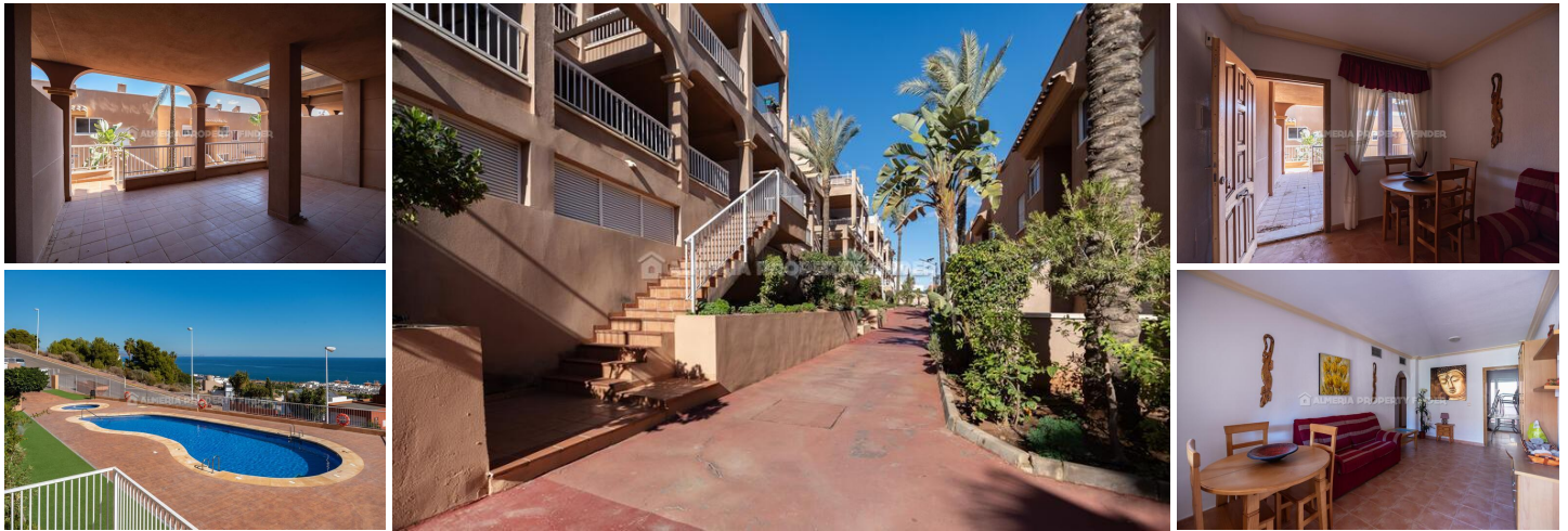
Apartment Chadwick I - An apartment in the Mojácar Playa area. (Resale)

Marina de la Torre : Ground floor 2 bed, 2 bath property for sale on a community with low community fees. There are two communal pools. You enter the property via a short flight of stairs onto a large covered terrace. The living room is a good size and has air conditioning. The kitchen has a service area off and is a good size complete with wall and base units.