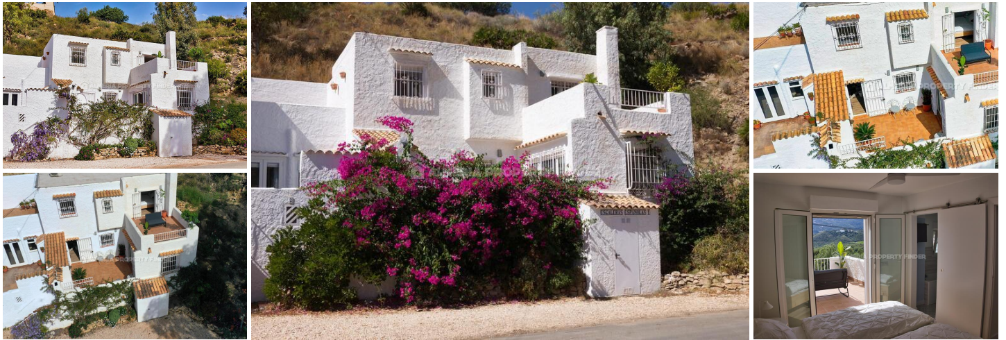
Town House Porter I - A town house in the Turre area. (Resale)

Escaleras Espanolas, Cortijo Grande : An altogether "state-of-the-art" house with 21st century systems. The property has recently been totally and completely refurbished to a very high standard with new wiring, plumbing, flooring and tiling throughout. It is a property with the 'WOW' factor and comprises 2/3 bedrooms and 3 bathrooms, fully fitted kitchen, living room / dining room and two terraces. All of the kitchen appliances are new with 5 year warranties including fridge, freezer, induction hob, extractor, fan assisted oven & dishwasher. All of the light fittings are with low energy LED bulbs. Both of the upstairs bathrooms have underfloor heating which is thermostatically and remote controlled. The living room and dining room have overhead DC motor fans and LED light with remote controls and all domestic plus sockets are complete with USB power points.