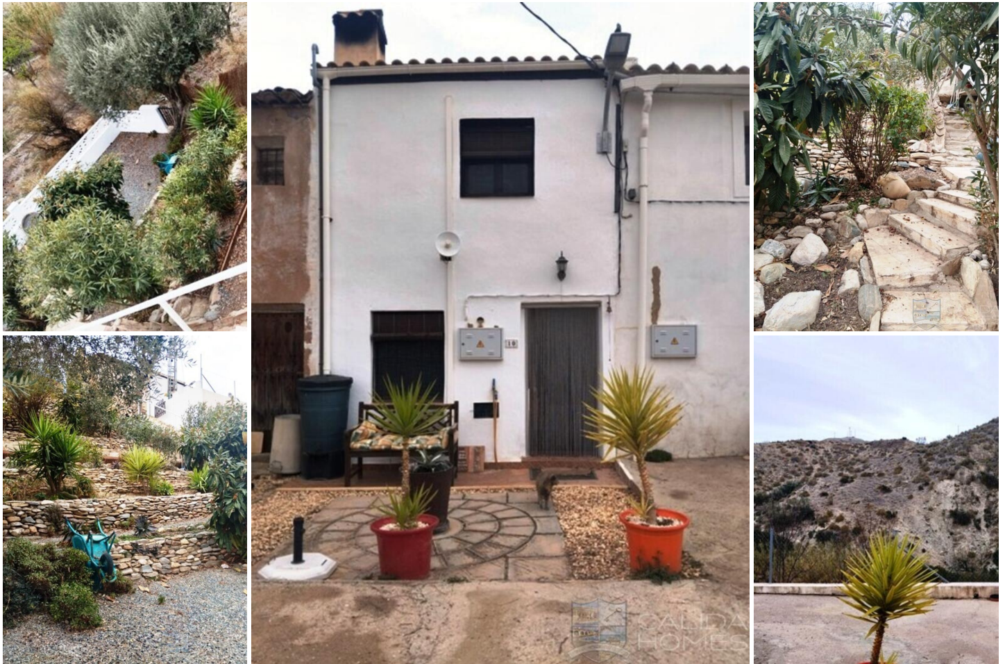
Cortijo Doris 2 and a ½ bedrooms, 1 and a ½ bathrooms

Set in the peaceful Los Molineros, Cantoria, 12 to 15 minutes drive from Arboleas town and a 2 minute drive to the popular Colorados bar/restaurant, fantastic tapa indoor and outdoor seating areas and pool table, a busy local bar with a great mix of Spanish and English.