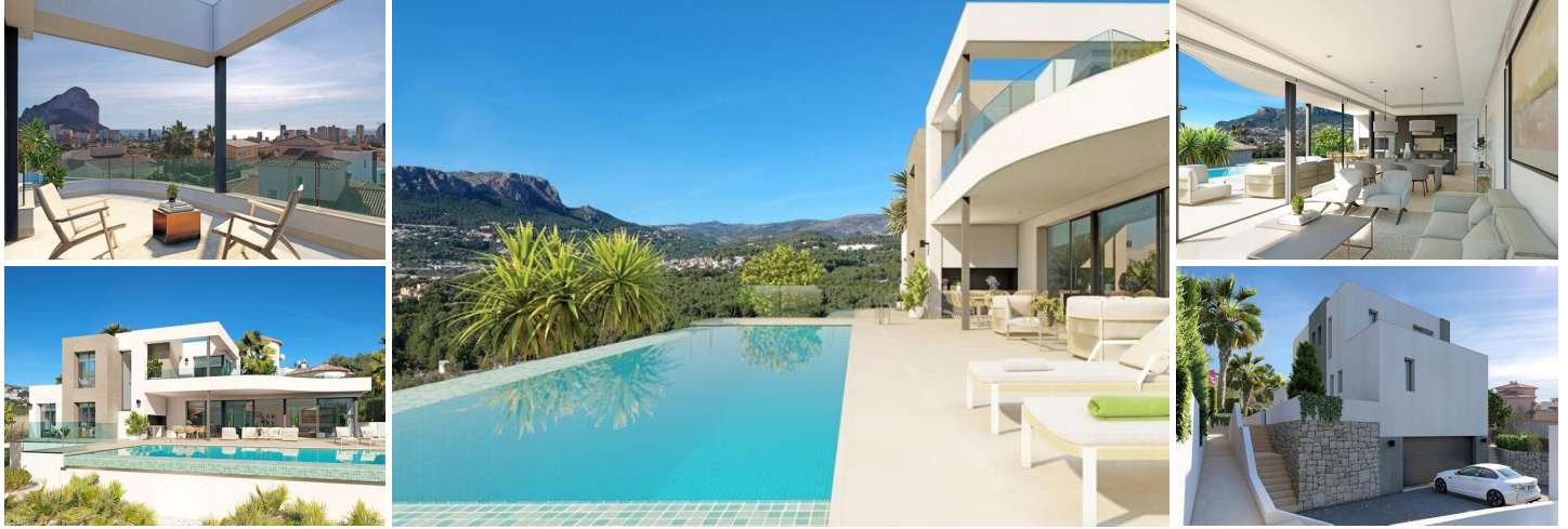
NEW BUILD LUXURY VILLA WITH SEA VIEW IN CALPE

This New Build villa situated in a prime location in Calpe, favoured by its residents for its close proximity to the town centre, beaches, and peaceful yet secure location on the outskirts of the town.