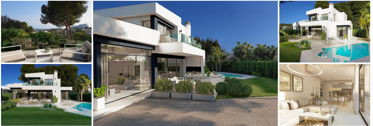
NEW BUILD VILLA WITH SEA VIEWS IN BENISSA

This beautiful house is located in a tranquil setting, just 1 km away from the stunning Fustera Beach, which has been awarded the Blue Flag for its excellent quality of water, sand, and facilities. The beach is also home to a well-known ecological trail that leads to Calpe and offers breathtaking views of the coves and cliffs along the way. The house is nestled among pine trees that provide privacy without obstructing the panoramic views of the Mediterranean Sea.