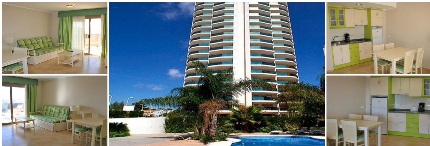
BEAUTIFUL APARTMENTS IN CALPE

Apartments located on La Fossa beach and a few meters from the pedestrian promenade and the Peñón de Ifach in Calpe.