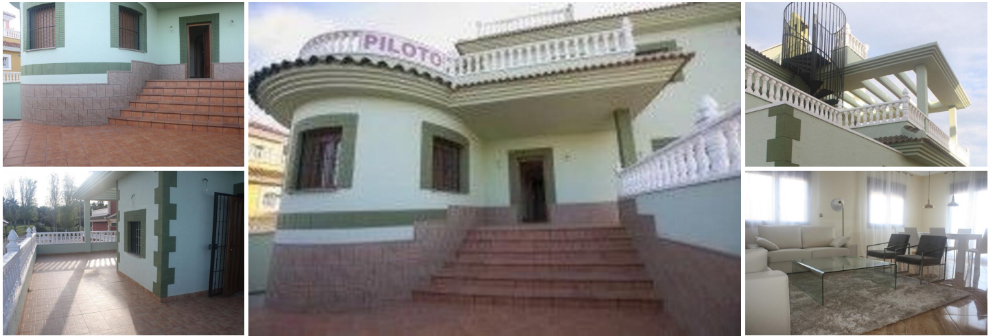
BEAUTIFUL VILLA IN LOS ALTOS, TORREVIEJA

Key Ready New villa in Los Altos located few minutes away from Hospital of Torrevieja and pink salt lake.