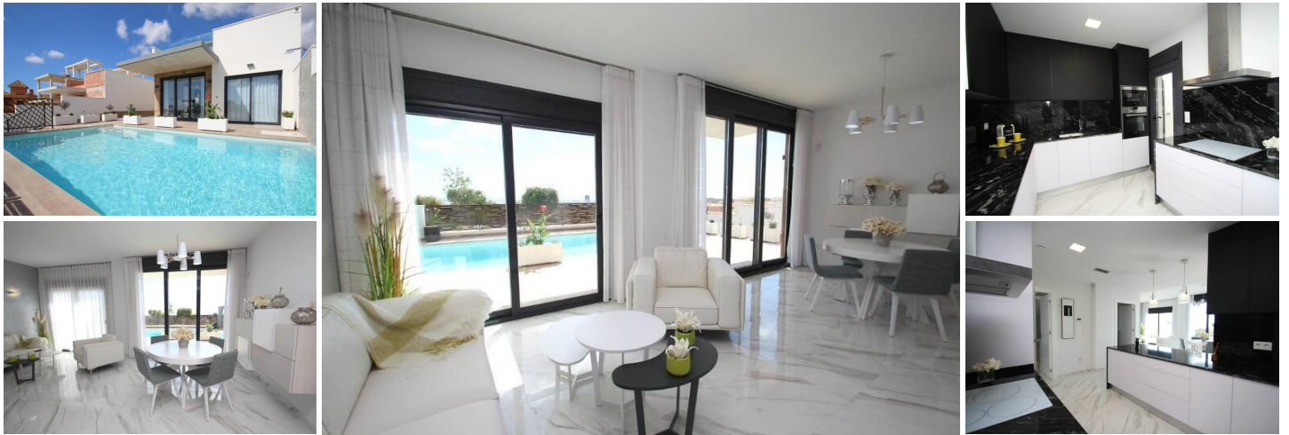
Newly built villa in Orihuela Costa

Do you want to enjoy an exclusive vacation near the sea? Impossible not to fall for this ultra-modern villa in Orihuela Costa with 2 bedrooms, 2 bathrooms, private pool, garden and luxury extras, according to personal preferences. Its delicate infrastructure integrates with nature providing a quiet and isolated environment.