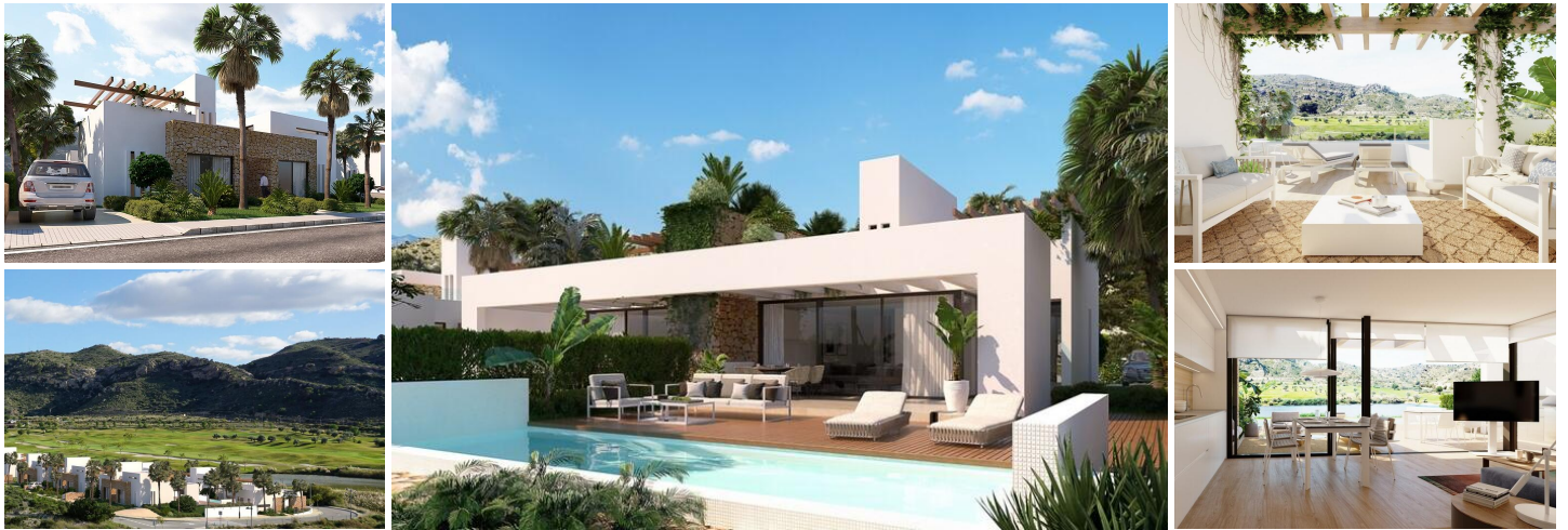
TOWNHOUSE WITH GARDEN, SWIMMING POOL AND PRIVATE SOLARIUM IN FONT DEL LLOP GOLF COURSE.

Townhouse with private garden, swimming pool and solarium, outdoor parking space and large communal green areas.