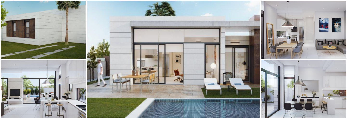
MEDITERRANEAN VILLA IN URBAN AREA CLOSE TO THE SEA

Well cared for and designed for your well-being, this house is clad in natural stone.