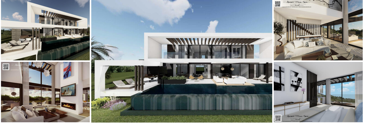
Residential Plot with Building License in MIJAS.

801m2 of surface for this plot located in a residential area of Mijas. The construction license has been accepted for a Villa project with swimming pool.