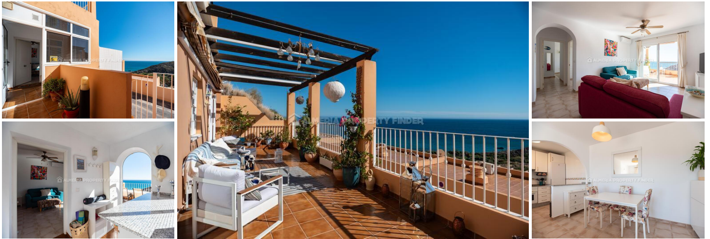
Apartment Dorathy - An apartment in the Mojácar Playa area. (Resale)

Puerto Marina II : We are pleased to offer for sale a very well presented detached end property that provides you with complete privacy and the most amazing open views of the Mediterranean. It is a first floor property, south facing and with a garage underneath so there are just a few steps that lead to the main entrance. It comprises living room / dining room that is open to the kitchen, the master bedroom with en-suite bathroom, a second bedroom and a guest bathroom. There is fantastically huge 39m 2 terrace and a closed garage.