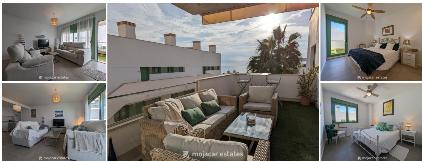
Cantal Homes Bal

Discover modern comfort in this beautiful apartment on the first floor, nestled within the newest complex in Mojácar Playa – Cantal Homes. Perfectly positioned at the southern end of Mojácar, this contemporary residence offers a tranquil retreat for up to 4 people with 2 bedrooms and 2 bathrooms. Situated in a prime front-line location, it overlooks the renowned Las Ventanicas Beach.