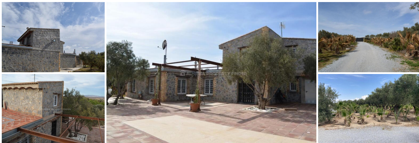
Cortijo Palmeras - A country house in the Baza area. (Renovated)

Cortijo with 1191 m 2 built, of which 304 m 2 usable area, 7745 m 2 plot area, 4 bedrooms, 2 bathrooms, 2 toilets, fully equipped kitchen, spacious living area, 2 swimming pools, palm trees and olive trees, pellet stove, pre-installation central heating, shutters, terraces, parking