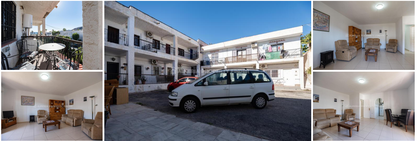
Apartment Mac - An apartment in the Mojácar Playa area. (Resale)

A great lock-up and leave property that is a minutes' walk to the beach, the bars & restaurants. The great location of La Gaviota it is an excellent base for holiday makers. The current owners successfully rent the apartment throughout the year. It comprises entrance hallway leading to the large living room with air conditioning that has patio doors to the terrace, the kitchen is a good size and well-equipped, there are two double bedrooms both with air conditioning and built in wardrobes and there is a good size bathroom with walk in shower. The terrace has room for a table and chairs and from here you can appreciate lovely sea and mountain views. The electrics are new and the kitchen has a new boiler.