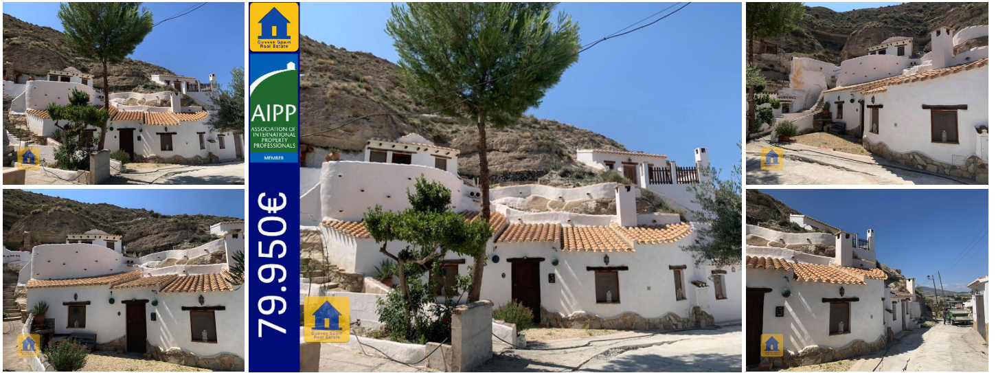
Cueva Javi in Galera

Cueva Javi is a beautiful cave house with tons of character. It is situated in a tranquil neighbourhood in the heights of Galera, with views across the valley. The main cave has 3 bedrooms and one bathroom. Above the main cave is a delightful ensuite bedroom with its own terrace. The mountain above the cave is beautifully natural and rustic.