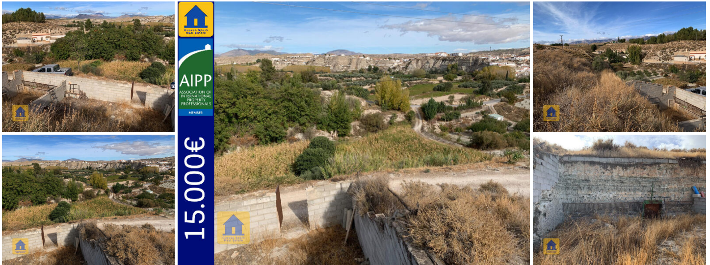
Cueva Mari Carmen Castilléjar

Small troglodyte house to renovate with fantastic views, just 1km from the village of Castilléjar.