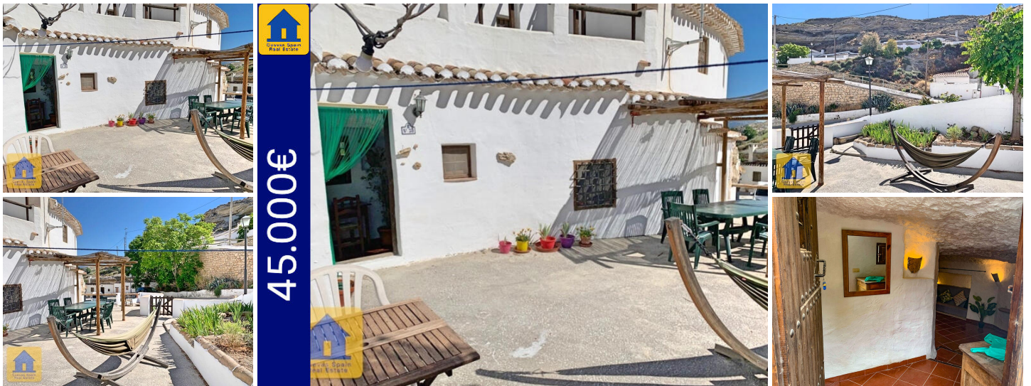
Galera Cave House Mallorie

This is a lovely, quirky, authentic cave house tastefully designed in a modern, minimalist style. There is a large patio with nice views and a private parking space. The entrance door has a tile eave and leads into an entrance hall. The living room and compact eat-in kitchen have a simple, zen feeling. Special attention has been given to the lighting. The wood burning stove in the kitchen has a practical baking oven. The kitchen design makes creative use of the space for storage and seating. There is a large, sunny main bedroom with a walk-in closet and a smaller double bedroom that could also be an office. The smaller bedroom is outbuild and has a wood beam ceiling. Each bedroom has a window, which is exceptional in a cave. The window of the main bedroom is built into an outer recess in the rock wall. There is a spacious shower room with a tile feature in the shower wall. The cave is sold with the furniture and is ready to move in.