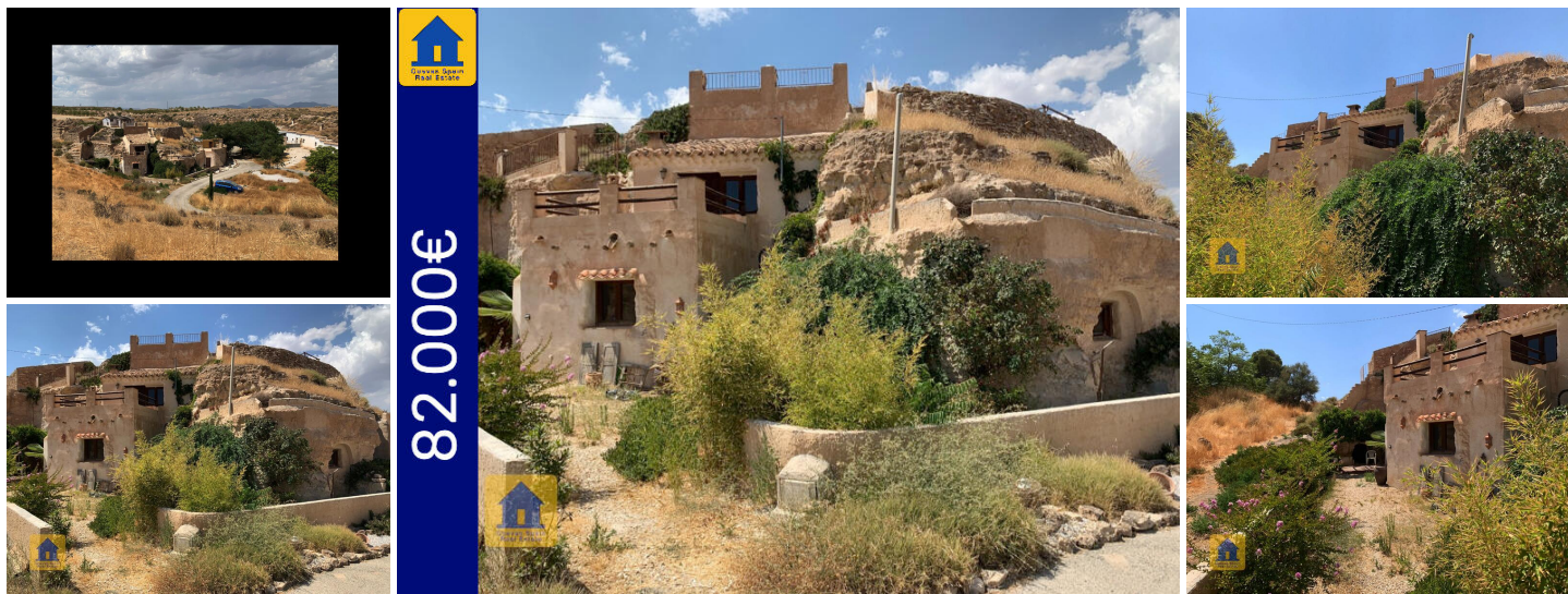
La Alqueria Cave House Divine

If you have ever dreamed of 'castles in Spain', this little gem could be just the thing for you. This unusual cave house is nestled in the curve of a hill in the hamlet of Alquería near the pretty village of Galera in Granada Province. The property has the feel of a fairytale house. It has 3-4 bedrooms, 2 bathrooms, a self-contained rooftop guest unit plus a small unreformed cave. This property has tons of potential to become whatever your imagination conjures up.