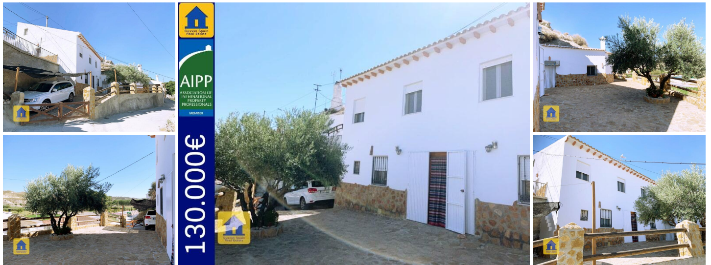
Castillejar Cave House Isabel

Large cave house up on a hillside of Castilléjar facing south-east with potential for three separate units. The property has a spacious, tiled front patio with a mature olive tree and magnificent views of the dramatic Badlands across the valley. From the patio, to the right one enters the cave and to the left one enters the two storey house. The three sections of the house are connected by an internal doorway. The main entrance to the house part leads to a very large, open plan living/dining/kitchen with bathroom and sleeping space as well. This could be a self contained studio. The top floor is an apartment with kitchen/dining room, bedrooms, and bathroom. It has an entrance that opens onto a patio leading to the road above. The cave has 3 bedrooms, a kitchen, and a bathroom. This property can be made into 2 units or 3 units. There is parking on the main level and on top of the house there is a large attic. There are lots of possibilities for this property including having a gym, large workshop or holiday rental. It is in a quiet location and ready to move in.