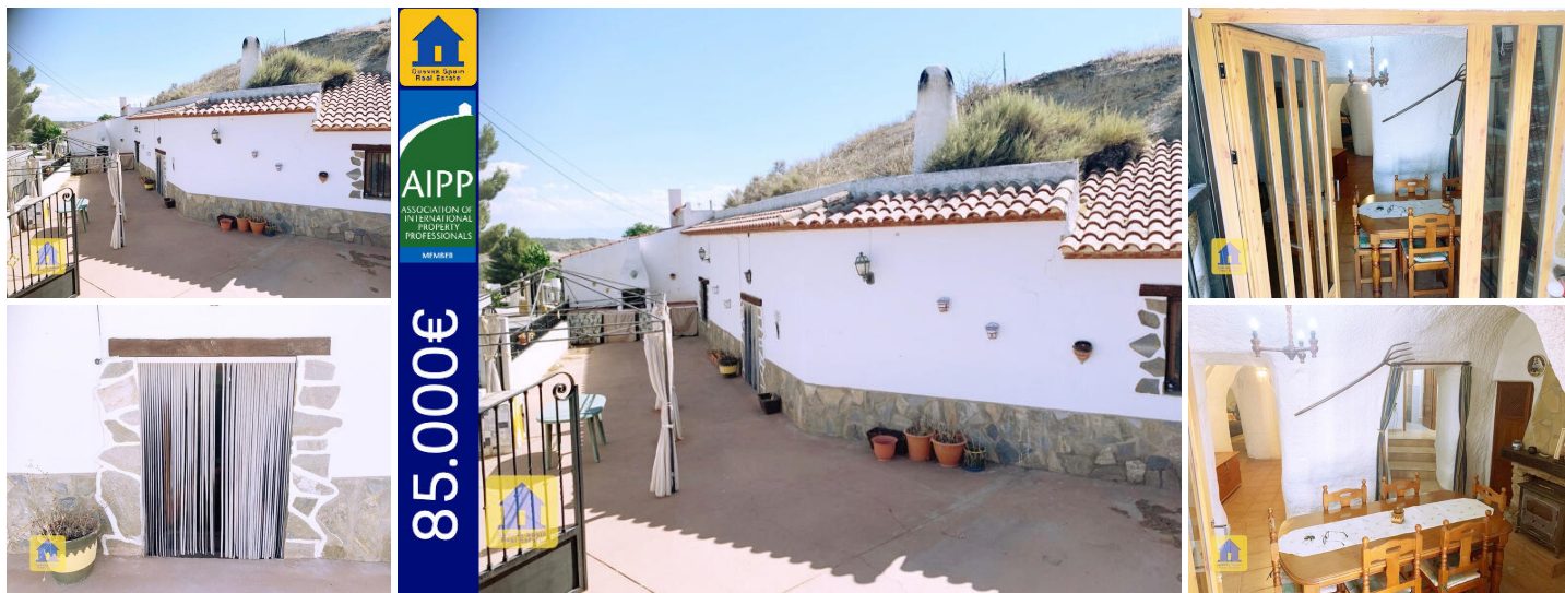
Cueva Leslie Los Olivos

Beautiful 3 bedroom cave in the quiet hamlet of Los Olivos. The property faces east-south-east with views of the Badlands. It has a large, gated patio with a shaded sitting area, barbecue and parking space. The house is fully cave with the exception of the kitchen which is outbuild. The entrance is through the dining room which has a wood burner, fireplace and storage cupboard. To the left are two bedrooms; one with a window and built-in closet. Straight on from the dining room is a wide hallway lined with quality wooden storage units, leading to a large salon with a light well and wood burner, and the third bedroom with wooden wardrobe. To the right from the dining room is the carefully finished full bathroom and large, sunny, fully tiled kitchen. The walls and ceilings are covered with projected cement, which gives a curvy, uniform finish. The floor tiles are uniform throughout, (except in the bathroom). The cave is sold nicely furnished. This property is in an impeccable state, ready to move in.