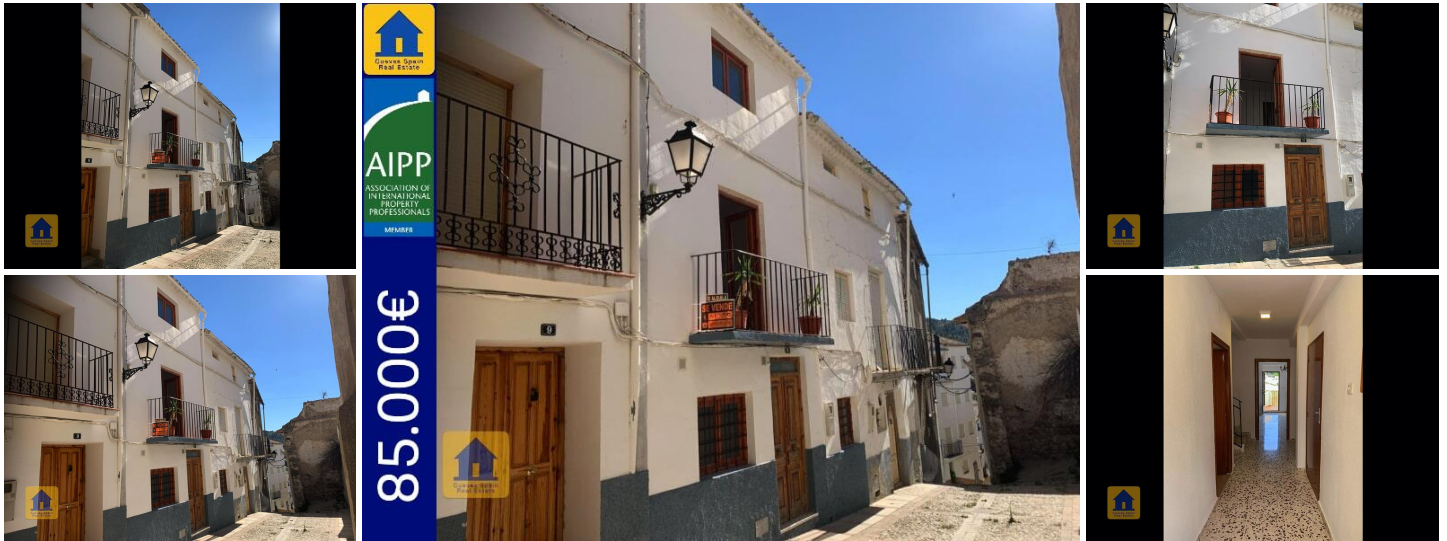
Town House Estrella in Castril