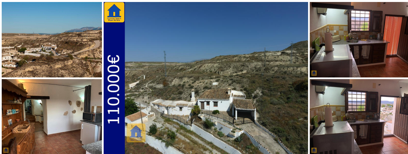
Galera Cave House Audrey

Two beautiful connected cave houses in the heights of Galera. The caves are totally independent and are designed to be lived in either separately or as one home,. Each one has a large terrace with fantastic views facing west and sun all day long. The cave to the right (facing the caves) is a spacious 1-bedroom with sleeping space for 2 guests in the living room, carport and utility room. The cave on the left has 3 double bedrooms, one with walk-in closet. Both caves have kitchens with views over the valley. Both have spacious bathrooms. Parking space in the driveway, more parking at the front. Less than 10 minutes walk to Galera village where you will find all amenities, tapas and restaurants. Easy access, just 2-3 minutes off the main road to Huéscar or Baza.