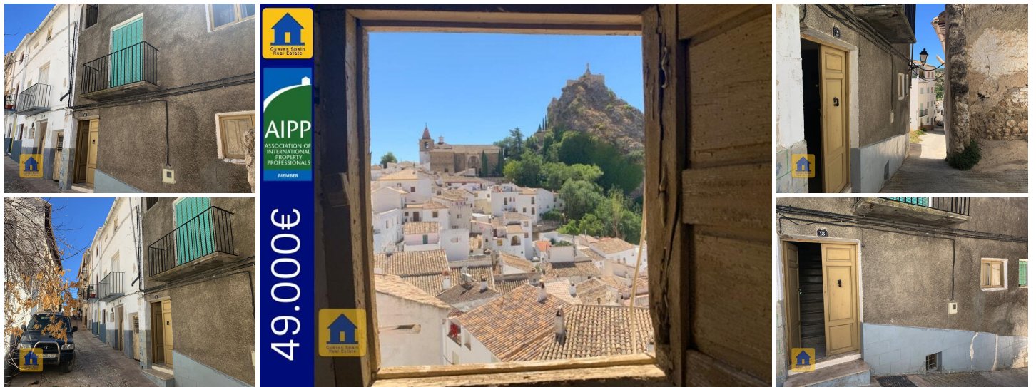
Casa chencha in castril

This is a very attractive, well maintained, traditional townhouse in the village center of Castril De La Peña. It is built on 4 storeys: ground floor, unreformed underground, 2nd floor and attic. It has one terrace on the ground floor level and one on the top floor with unbeatable views on the village and the Saint covering south-west to north, with the Cazorla Mountains in the background. This village house can easily be transformed into two units, one could be rented as an income. The property needs at least a bit of reform although it is liveable as it is. There are 3 to 6 bedrooms and 1 bathroom. Lots of walls inside the house can be taken out to make larger rooms and increase the sense of spaciousness. There is car access to unload and even to park in front of the house. The price is more than attractive, and the location is ideal if you are mostly walking. Castril is a stunning village in the Cazorla Mountain range, with its reservoir and natural park, one of the jewels of Andalusia.